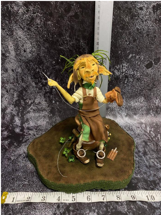
Figure 3 Rhianydd Webb Dragons & Daffodils sample measuring image

End small decorative exhibit category H 7 images. Failure to provide these images will result in disqualification (not to schedule/NTS).