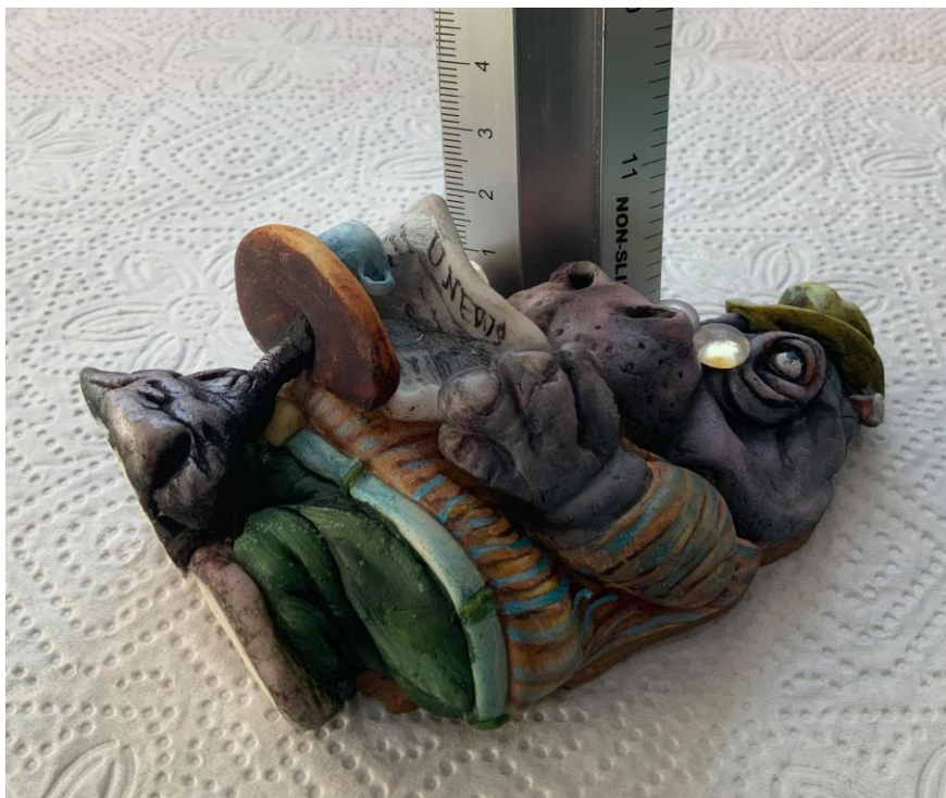
Figure 1 Silviya Jankowski Bicky Piccy measuring image

Total 7 images and a measuring image. Failure to provide these images will result in disqualification (not to schedule/NTS).