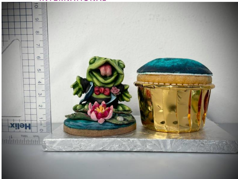
Figure 2 Silviya Jankowski Bicky Piccy measuring image